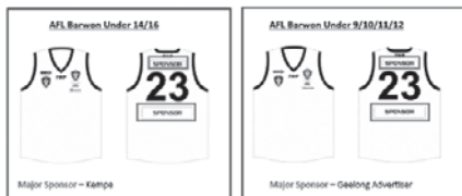
JUMPER DESIGN – AFL Barwon Juniors (Male and Female)